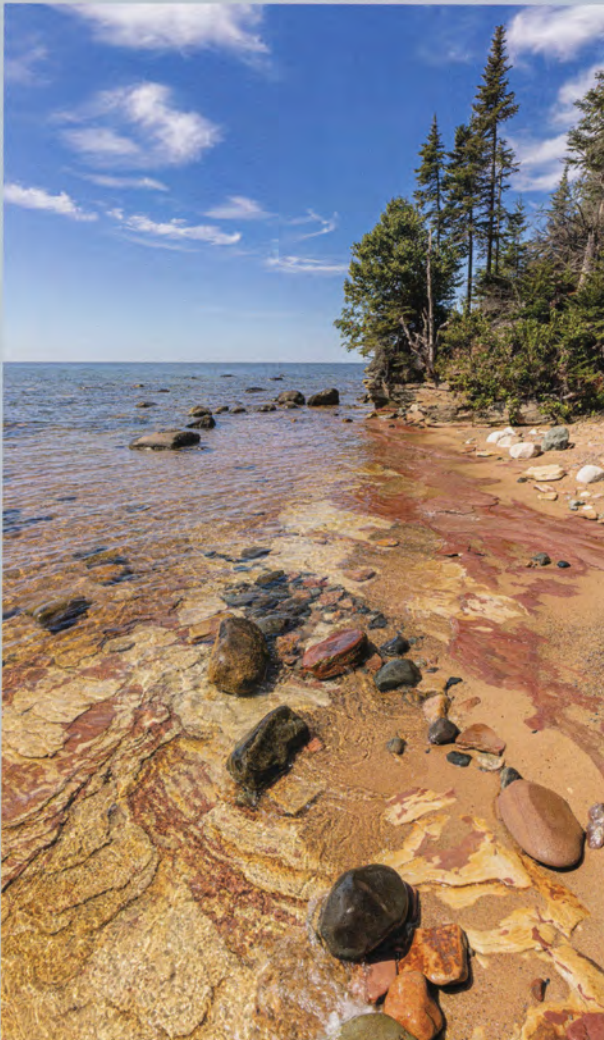
Bottom left: Clear water and colorful stones create the shoreline at Sandy Islands Provincial Park.